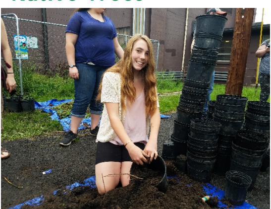
trees in our communities to reduce the amount of pollution entering our streams, provide oxygen, and create habitat for wildlife.

The Growing Native program is teaching students about the critical importance of having