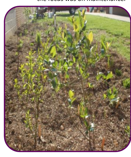
* the focus was on maintenance.